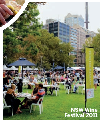
NSW Wine Festival 2011