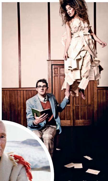
Paper Sky: a Love Story (Auckland Arts Festival 2011)