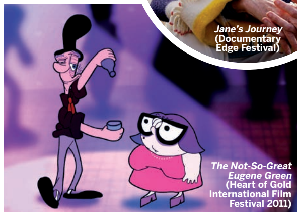
The Not-So-Great Eugene Green (Heart of Gold International Film Festival 2011)