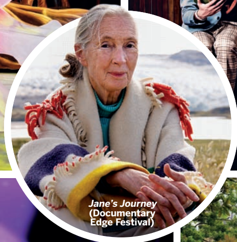
Jane's Journey (Documentary Edge Festival)