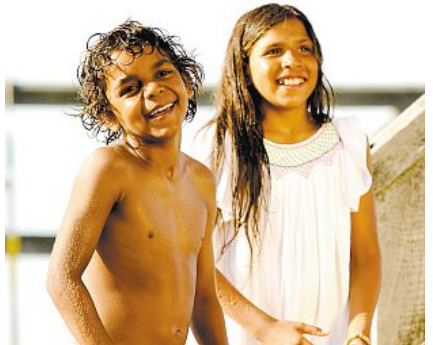
ACCOLADES: Minnie Loves Junior which will screen at this year's Heart of Gold Gympie Film Festival, recently received rave reviews at the 2011 Berlin International Film Festival.